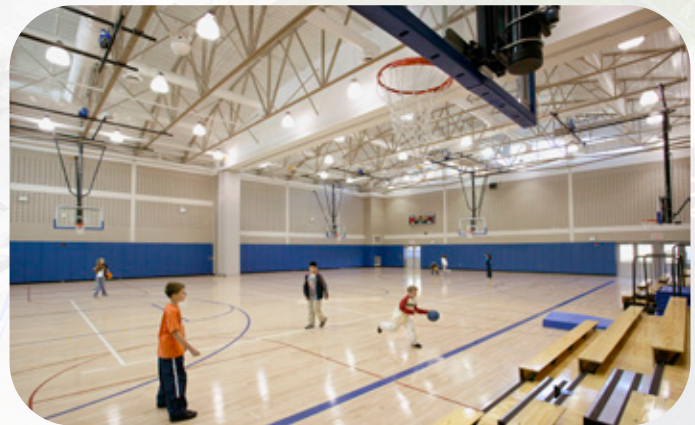
A representation of the new gymnasium planned at the Arden Hill Campus.