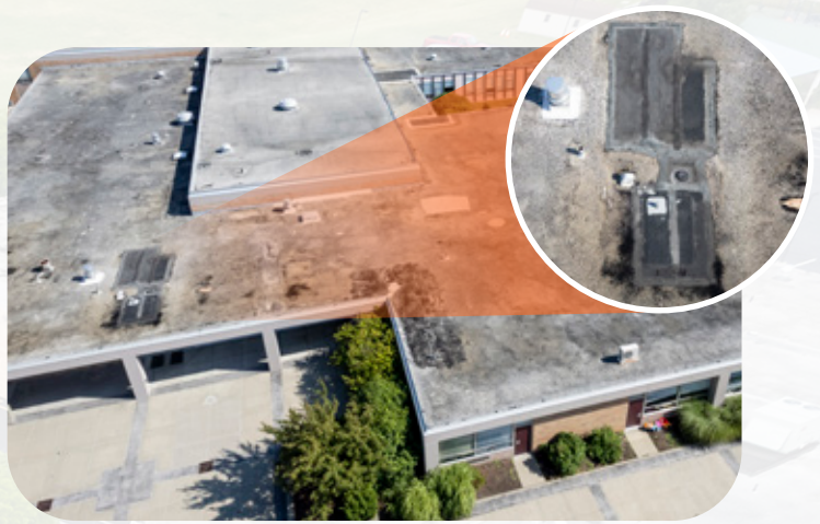
Temporary repairs on a 50-year-old roof on the Axelrod building.