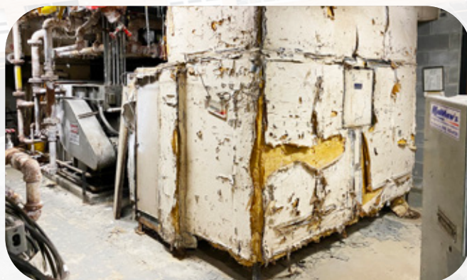
Deteriorating and outdated mechanical equipment.